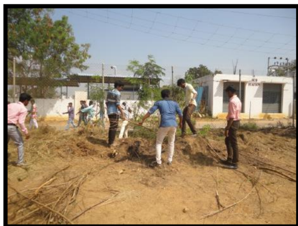
SREC Campus cleaning by our NSS volunteers on 16.2.2018