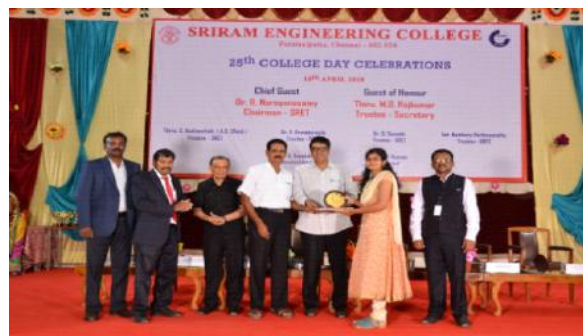
The Chairman & Secretary of SRET distributing the Shield and Certificate to the Academic Achiever