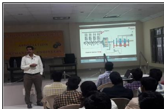
Dept. of Mechanical Engineering conducted a Guest lecture on Recent Advancement in design of transmission systems