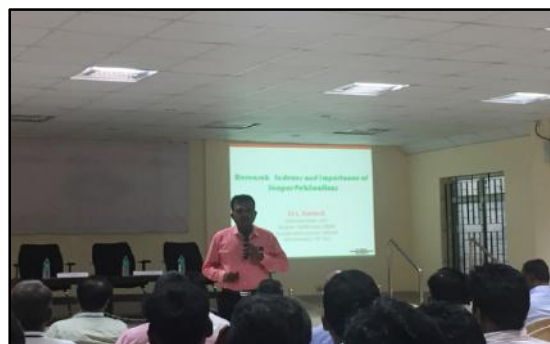
A Guest lecture on Importance of Research Index & Scopus Publication was conducted by our college on 26.06.2018