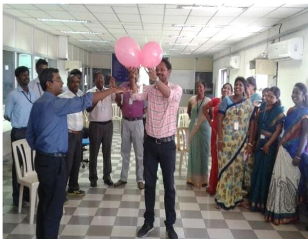
A staff actively participating in the activity