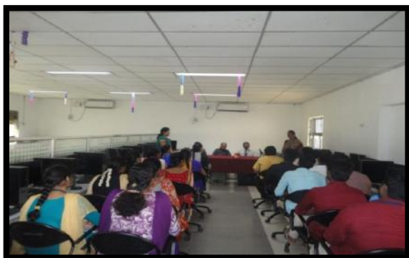
Participants during the inauguration of BEC

The British English Certificate (BEC) Programme was inaugurated on 09.03.2018 to enhance good communication skill among the students.