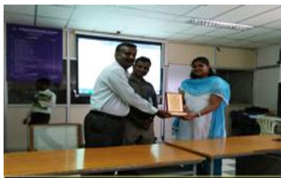
Dept. of CSE conducted a Guest Lecture on Lecture on Service Oriented Architecture