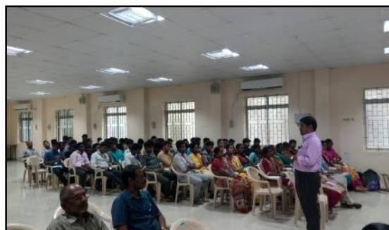
Dept. of Chemical Engineering conducted Guest Lecture on Solid waste management