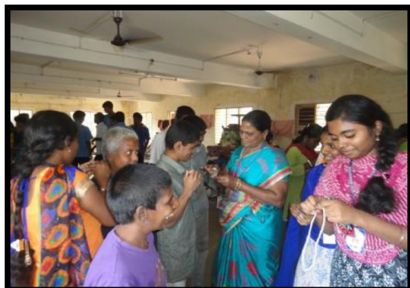
NSS student service for Mentally challenged people of Balavihar Home, veppampattu on 19.2.2018