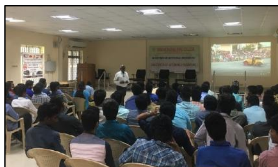
Dept. of Automobile conducted a Guest lecture on Accident Prevention and Energy Conservation