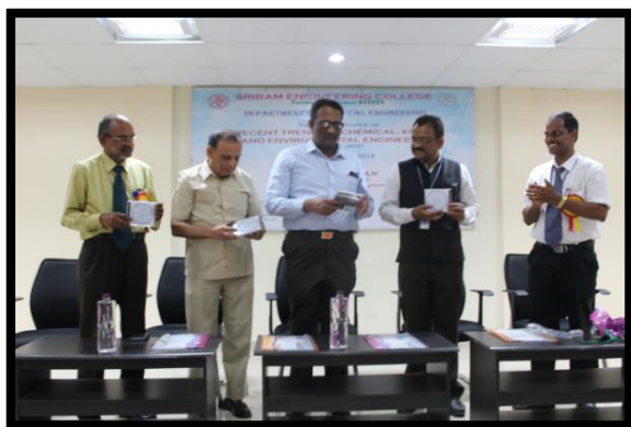
Release of conference proceedings by the Chief Guest