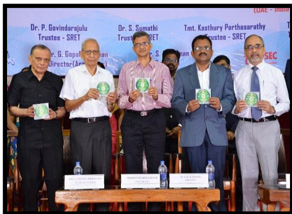
Release of conference proceedings by the Chief Guests