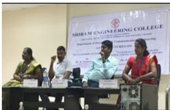
Dept. of ECE conducted a Guest Lecture on VLSI Design Methodologies, Applications and Recent Trends & 5G Waveform Techniques