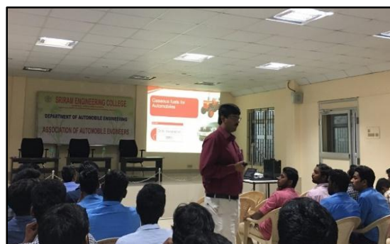
Dept. of Automobile conducted a Guest lecture on Recent Developments in Alternative fuels CNG / LPG/H2