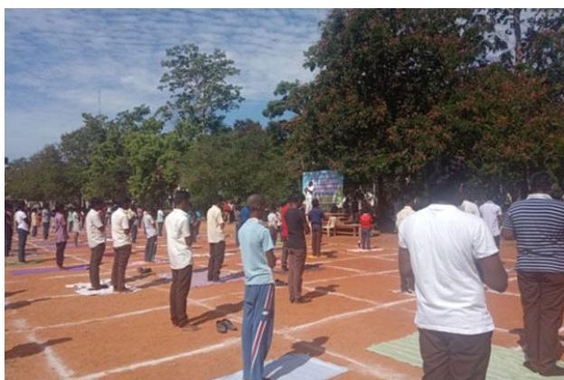
Students practicing yoga in the campus

"International Day of Yoga" was conducted on 21 st June 2018. Nearly 300 students of Sriram Educational Institutions participated in the event. The Programme was started with an introduction about Yoga followed by prayer. Special Yoga demonstration viz, loosening practices, Yogaasanas, Pranayama Mudras was given.