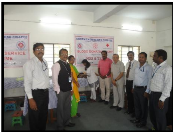
Student donating the blood during the camp