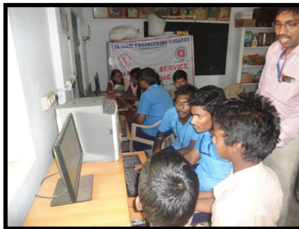
Computer training program for Govt. Middle school students, Perumalpattu was given by the NSS students on 15.2.2018

The Youth Red Cross (YRC) and National Service Scheme (NSS) unit of Sriram Engineering College jointly conducted a blood donation camp on 13.02.2018 in association with Kilpauk Medical College Hospital, Chennai. The Director (Academics) and Principal, inaugurated the camp by 10.00 a.m. A total of 125 donors had donated their blood during the camp. In addition, several activities were carried out by the NSS Students.