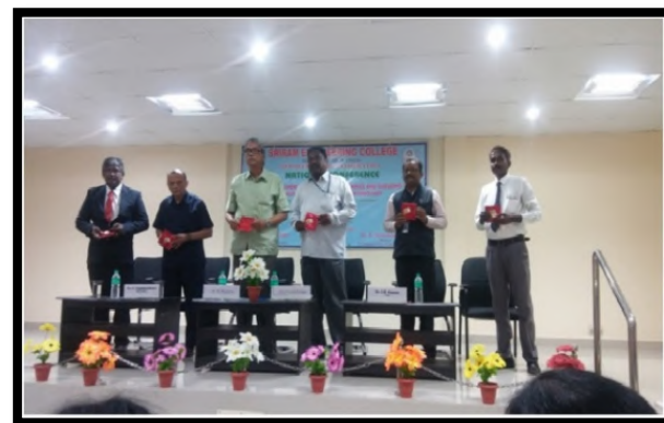
Release of conference proceedings by the Chief Guest