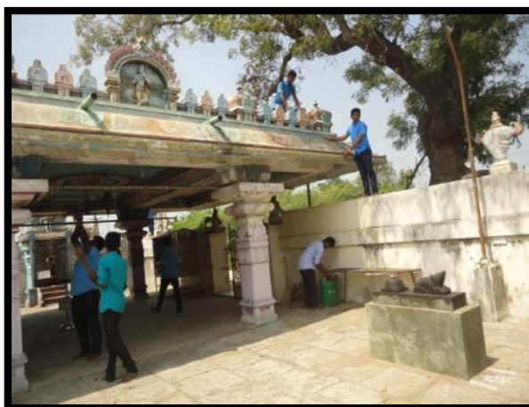
Cleaning activity by our NSS volunteers in the Lord Pandurangasamy Temple premises, perumalpattu on 14.2.2018