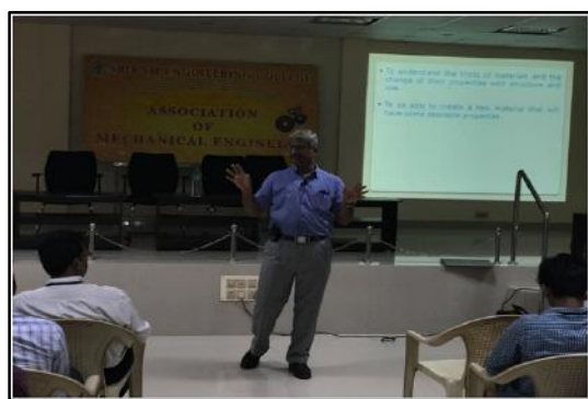
Dept. of Mechanical Engineering conducted a Guest Lecture on Advances in Materials and Metallurgy