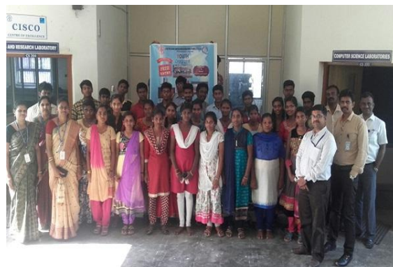
Youth Camp 2018: Group Photo with all the participants

Summer Refresher Youth Camp 2018 was organized by the Department of CSE and EEE for the benefit of +2 science students on 11.04.2018. Around 50 students from various schools actively participated in this youth camp.