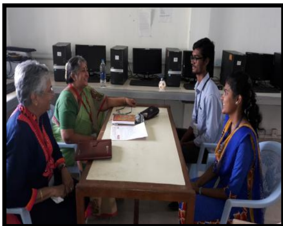
The BEC Examinations (Speaking Skill) was conducted on 22.03.2018