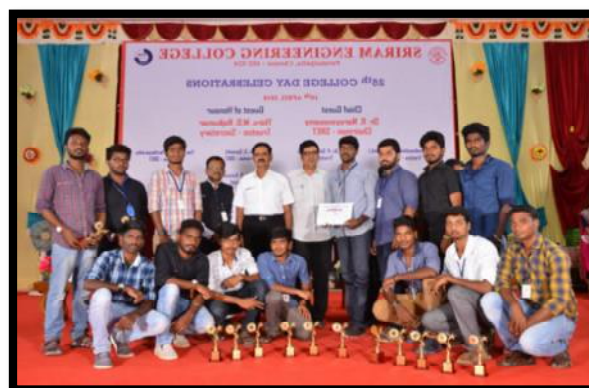
Shields and Certificates were distributed to Sports winners