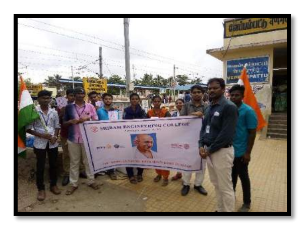
Environment Cleanliness Awareness Rally