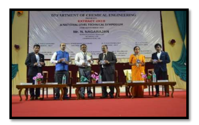
Dept. of Chemical Engineering conducted a National level technical symposium on EXTRACT 2K19