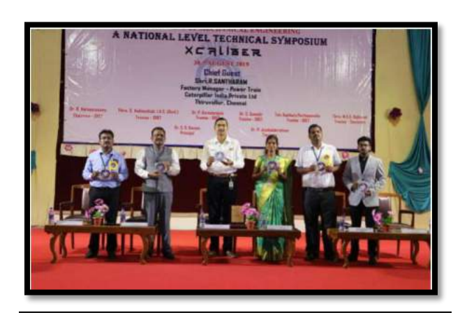
Dept. of Mechanical Engineering conducted National level technical Symposium on XCALIBER - 2K19