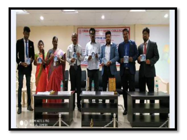
Dept. of Electronics & Communication Engineering conducted National level technical Symposium on Attune 2K19