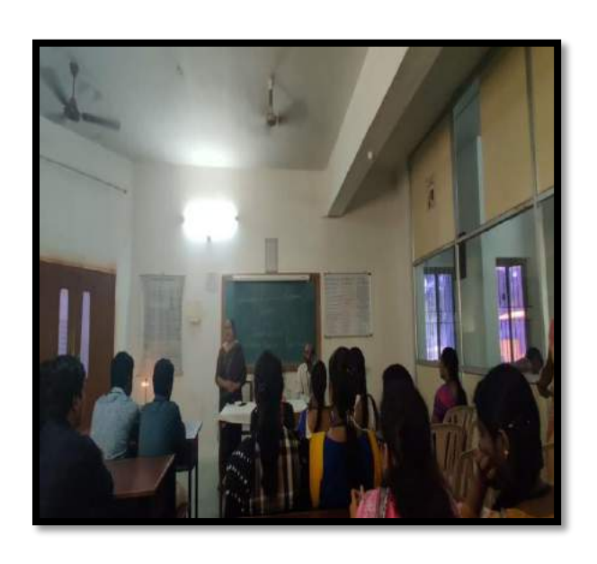
Dept. of chemical Engineering conducted a Guest lecture on Role of chemical engineers in Indian economy.