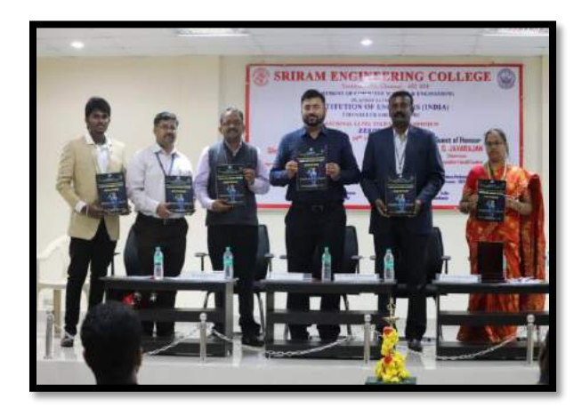
Dept. of Computer science & Engineering conducted National level technical Symposium on ZERONE 2K19