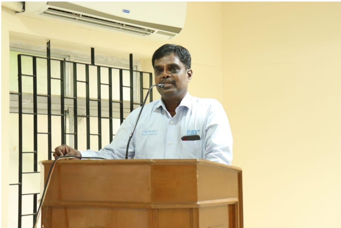
Address by Chief Guest at DRACARYS 2K19 Symposium