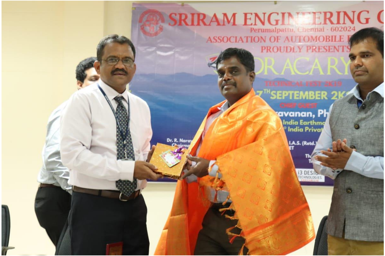
Principal honoring Chief Guest