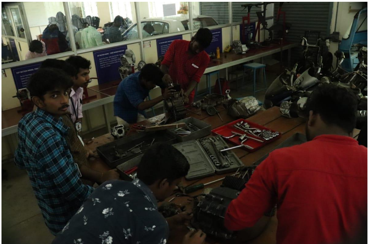
Students at the Engine assembling and dismantling event